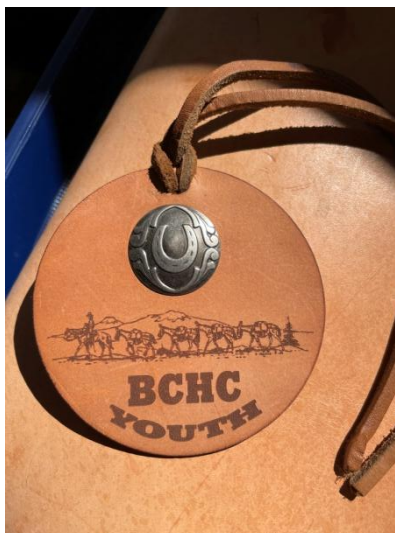
Example of the individual achievement award

Each youth participant must register by filling out the BCHC Youth Program Permission Form including both parent and child signatures. This form is to be kept on file by the Unit Youth Leader during the youth's participation in the program. The need for the form includes: unit, age of child to determine which age group they are competing in, contact information for upcoming youth events, permission to use photographs and a statement that each participant understands the Code of Conduct required while participating in BCHC youth events and activities. A copy of the form is to be sent to the BCHC VP of Youth Education to qualify for the awards program.